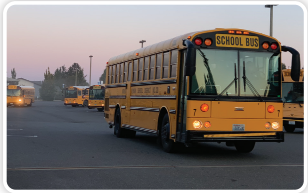
The Mount Vernon School District bus fleet departs at 6am for their first run.